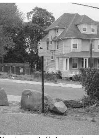
New sign atop the black post on the west side of the Aqueduct trail at Lamartine Ave.

which is close to where the water tunnel turned east to make its way to New York City. directional Four signs installed this fall by State Parks should help solve the problem. The signs on the trail are located at Lamartine Ave.: at Palisade Ave., close to Ashburton Ave.; at Prescott St., just off Yonkers Ave., east of ventilator 22; and at the north end of Tibbetts Brook Park.