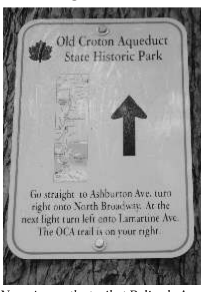
New sign on the trail at Palisade Ave.

Each sign has verbal directions for how to find the