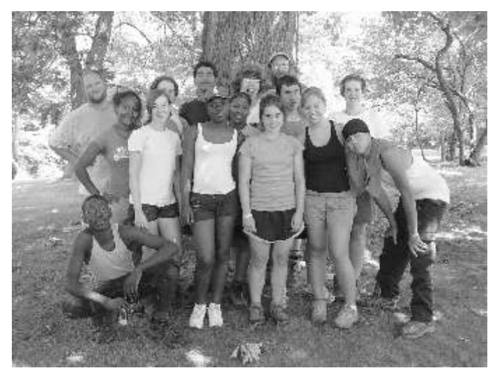
The group at Draper Park, Hastings.

The students, half from Brooklyn's New York Harbor School and half from Sidney High School in rural