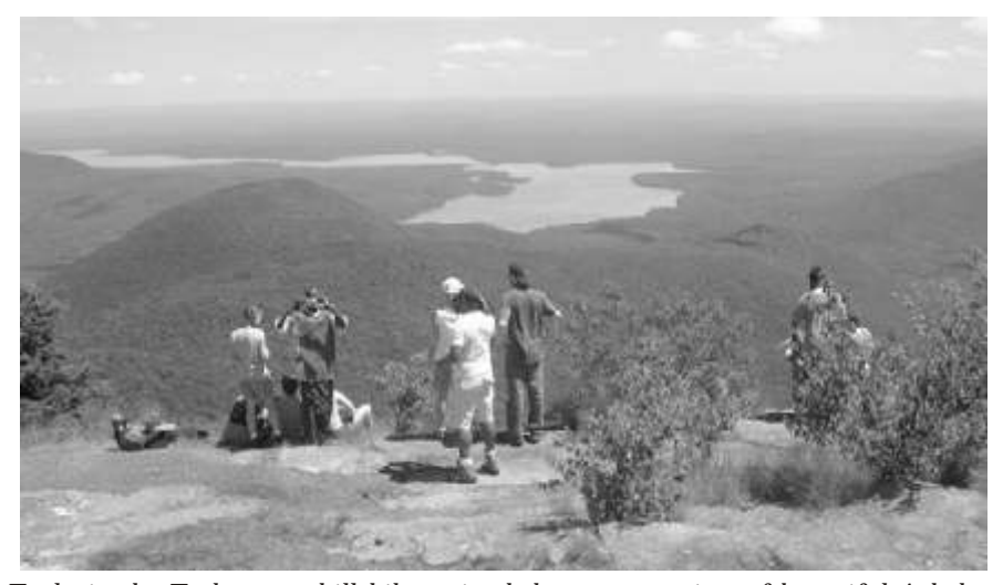
of the High Bridge Coalition, accompanied Early in the Trek, an uphill hike gained the group a view of beautiful Ashokan

The complex logistical planning for the Trek was led by the Stroud Water Research Center and New York City Department of Environmental Protection.