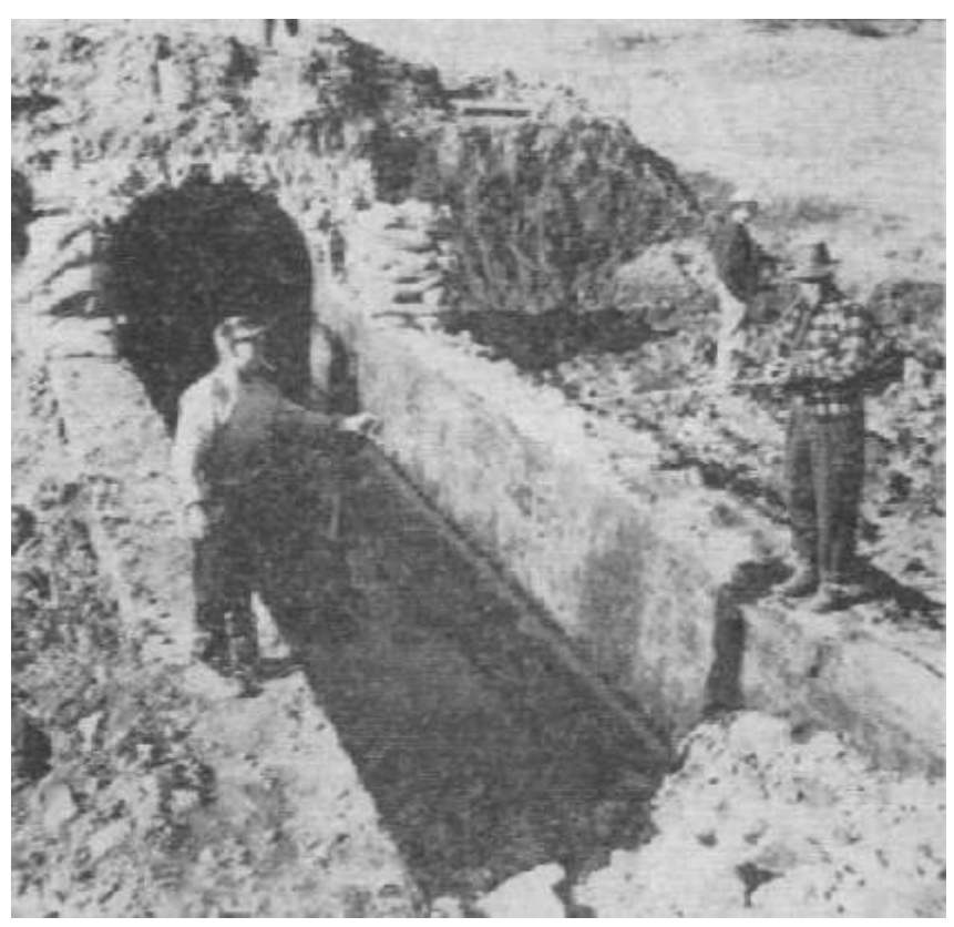
"Croton Aqueduct had to be reinforced with steel pipe during construction of the New York State Thruway. Here workmen measure the gap across the aqueduct to fit the pipe. Use of the pipe will prevent collapse of the aqueduct when traffic starts using Thruway. – Photo by Dan Berry." 1955. (News clipping courtesy of the Historical Society of Sleepy Hollow and Tarrytown)

pedestrian bridge over the Thruway should be incorporated into the bridge project, in order to restore the segment of the Aqueduct trail between Route 119 and Sheldon Ave. Since the 1950s, when the Tappan Zee