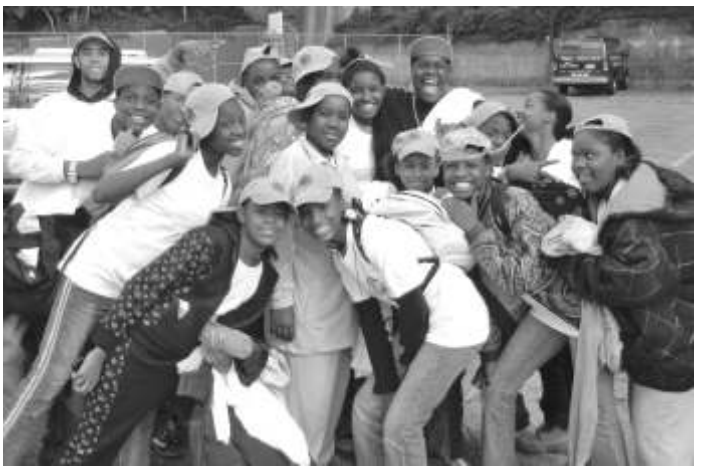
Youth group members from the Nepperhan Community Center enjoyed the "edutainment," performed on the drums, and helped with a cleanup on AqueFest day in Yonkers. Here they sport their Friends of the Aqueduct caps.